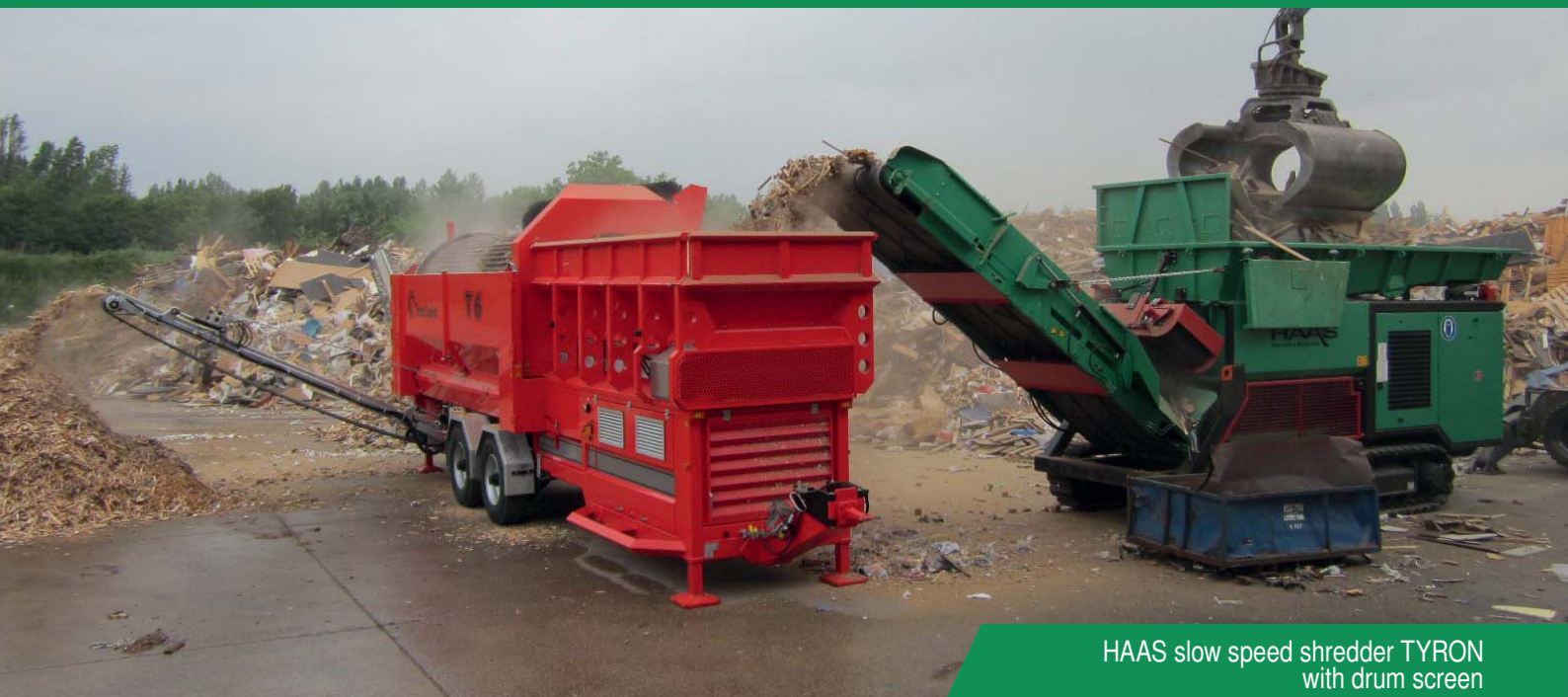
HAAS slow speed shredder TYRON with drum screen