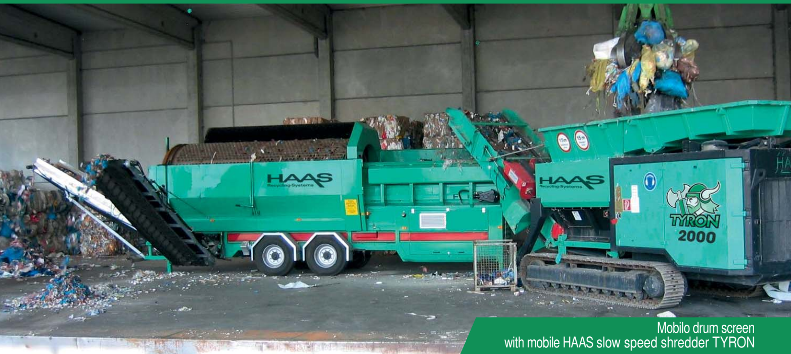
Mobilo drum screen with mobile HAAS slow speed shredder TYRON