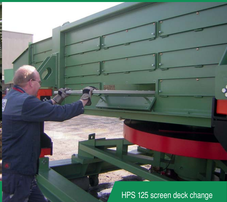
HPS 125 screen deck change