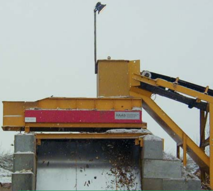
HSSO 1250 x 4000, > 120 mm