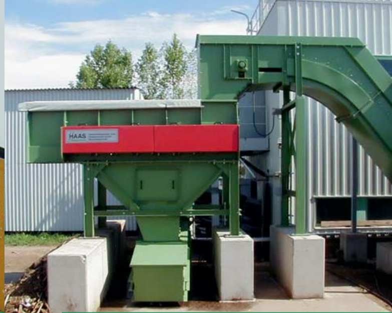
HSSO 1.000 x 2.500, oversizes > 150 mm