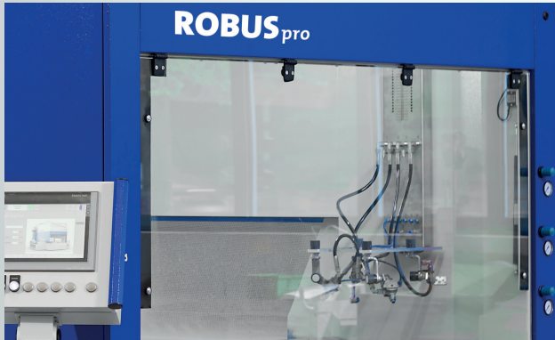
Das ROBUS pro Schlittenläufer-System mit bis zu 6+6 Pistolen. The ROBUS pro reciprocating system with up to 6+6 guns.