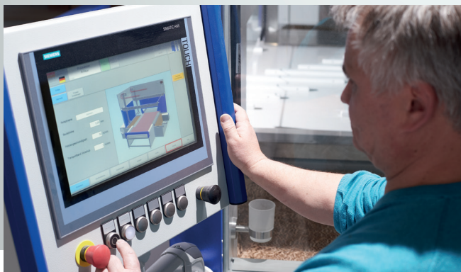
Einfach zu verstehen, optimal zu bedienen - das für Bürkle Anlagen einheitliche Bedienerpanel erklärt sich von selbst.

Easy-to-understand, user-friendly and uniform for all Bürkle products – the HMI is self-explanatory.