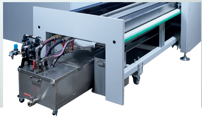
Lackrückgewinnungs- und Bandreinigungseinheit mit durchdachten Detaillösungen.

Easy-to-understand, user-friendly and uniform for all Bürkle products – the HMI is self-explanatory.