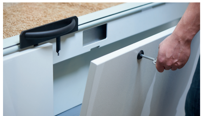
Durchdachte Maschinendetails für einfache Rüstung und einfache Wartung.

All filter units are fitted with a quick-change system. 5 filter levels result in perfect air purification and ideal air quality in the spray cabinet and ensure high quality results.