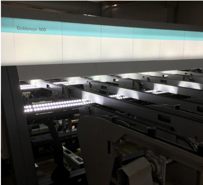
Goldeneye 900 features Multi-Sensor cameras and sensors for laser scattering, laser 3D triangulation, color analysis.

Goldeneye 900 Multi-Sensor Transverse Quality Scanner reliably identifies wood defects, grading both planed as well as rough lumber as four-sided or two-sided scanner.