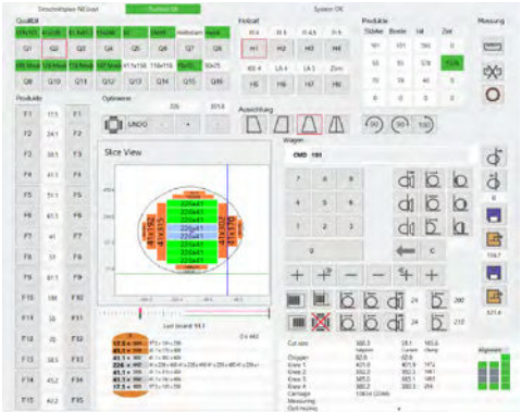
Touchscreen display for band saw control

“The Logeye alone gives us about 5% more cutting performance.” Pfeifle Holz, Germany