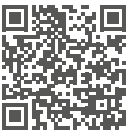
Case Study Video Review Gruber Holz - South Tyrol, Italy