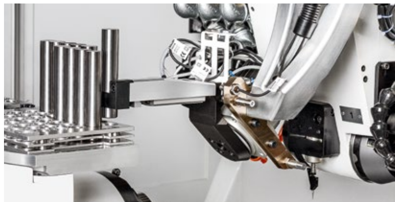
Option Top loader

Productivity Package (24 kW spindle and glass scales); Top loader; HSK spindle; measuring probe for measuring the grinding wheels; manual support steady rest; manual tailstock; workpiece holder with torque motor; sharpening stone holder; work table; vapour separator; silencer; fire extinguishing system; Automatic, electric measurement of machine reference (AEMDM); etc.